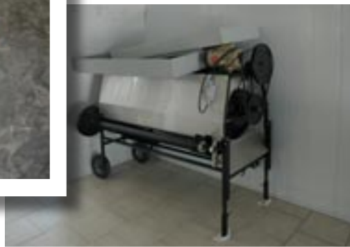
ca 2006 Equipment such as this mechanical pea-sheller, designed and built by members of an Alberta Hutterite colony, has been made available for other colonies across western Canada.