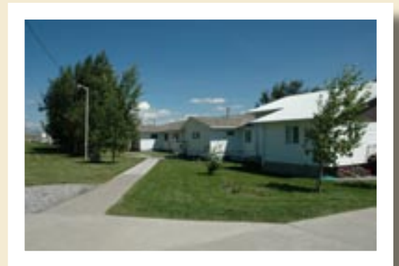
ca 2006 Residential facilities on an Alberta Hutterite colony Canada Agriculture Museum

commencement of the First World War in 1914, their communal lifestyle, pacifism, and use of German meant Hutterites in the United States were the focus of much patriotic anti-German fervour. In 1918, this, and the severe prison sentences meted out to a number of young males who refused to take up active military duty, caused large numbers of Hutterites to move north to Canada into Alberta and Manitoba. In Canada during the Second World War young male Hutterites joined many other pacifists in Alternative Service Program camps in Canada's National Parks, building facilities and roads. There are now estimated to be four hundred colonies in Canada's three Prairie provinces (Manitoba, Saskatchewan, Alberta), British Columbia, and the United States.