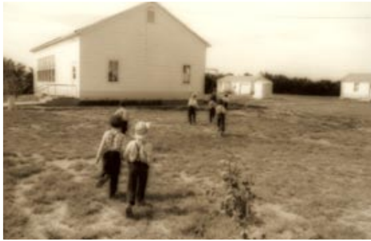
ca 1970 Hutterite children head off to the school on their Saskatchewan colony.