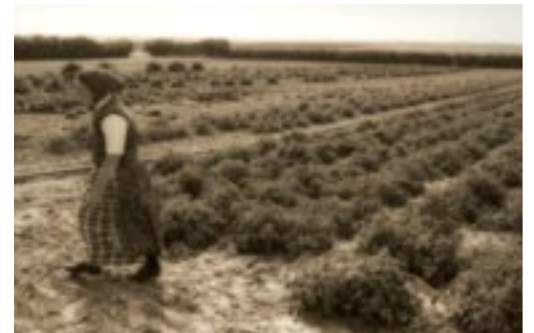
ca 1970 The "potato patch" of a Saskatchewan Hutterite colony's garden

the colony supplied with basics such as flour and sugar and for the storage of the hundreds of jars of preserves made from produce grown or gathered by colony members. Walk-in freezers are used to store perishable foodstuffs such as meat and fowl. There are two dining halls, one for adults and another for children. For the children, the eating of meals together emphasizes the communal nature of all aspects of life on a colony. In the adult