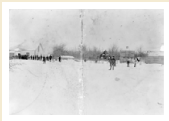
ca 1898 Members of the Diamond City Hutterite colony outside their church

Although they had been promised exemption from military service, by 1898 militarist sentiments due to the Spanish American War brought that status into question, leading them to petition the Canadian government whether immunity from military service might be available north of the border. A favourable reply from the federal immigration agent based in Winnipeg led at least one colony to decide to immediately move north to Diamond City, Manitoba. Later, with the