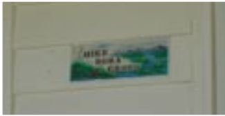
ca 2006 Colony members' names are often found on small signs near the entrance to their residence. Canada Agriculture Museum

furnishings. On the other hand, on most colonies telephones as well as computers are essential operational tools. Families are responsible for the upkeep of their quarters, and many develop small flowerbeds by their entrance porch.