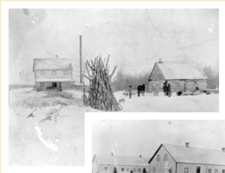
ca 1898 The first Hutterite Brüderhof in Canada near Diamond City, Manitoba; note the steam-powered grist mill at left.