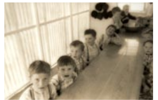
ca 1970 Children's dining table on a Saskatchewan Hutterite colony