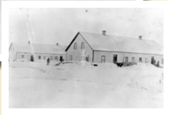
ca 1898 Communal residences at the Diamond City Hutterite colony Glenbow Archives NA-728-4

Although they had been promised exemption from military service, by 1898 militarist sentiments due to the Spanish American War brought that status into question, leading them to petition the Canadian government whether immunity from military service might be available north of the border. A favourable reply from the federal immigration agent based in Winnipeg led at least one colony to decide to immediately move north to Diamond City, Manitoba. Later, with the