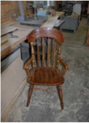
ca 2006 Chairs such as this, manufactured in an Alberta Hutterite colony's woodworking shop, would be used in members' residences.